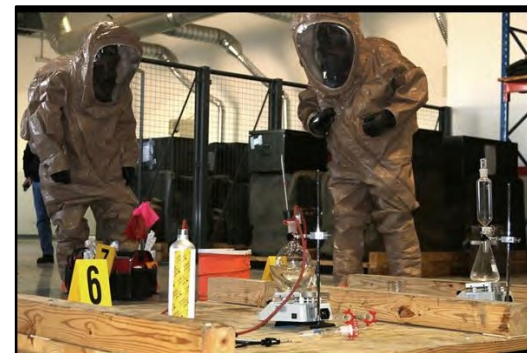
Colorado National Guard members demonstrate CBRN capabilities with their SPP partner in Jordan