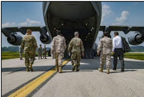
A delegation from Qatar visits West Virginia to commemorate the newest SPP partnership and learn more about WVNG capabilities