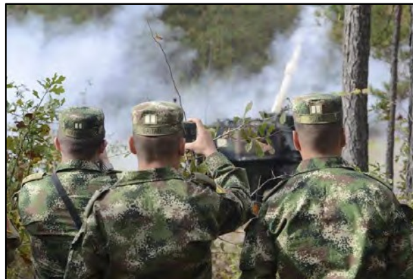
Colombian army leaders observe a live-fire exercise during an SPP exchange with the South Carolina National Guard