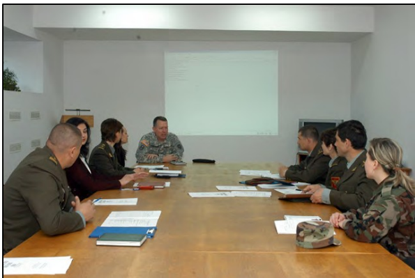
North Carolina NG Public Affairs officer and Moldovan Ministry of Defense officers discuss key points of effective public relations