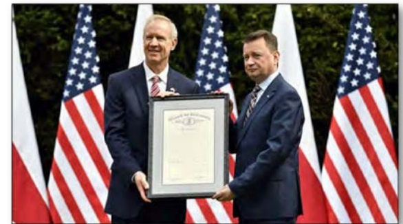
Illinois Governor Bruce Rauner presents a 25 th anniversary plaque to Poland Defense Minister Mariusz Blaszczak