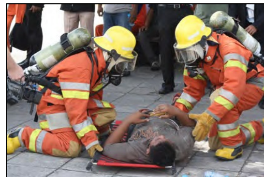
Washington National Guard members hone their port security and emergency response skills with their partner in Thailand