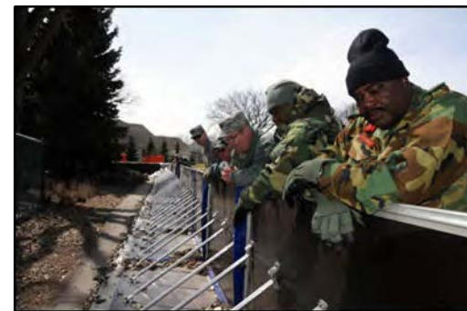
North Dakota NG and visiting Ghanaian dignitaries tour flood protection facilities, including an AquaFence in Fargo, ND