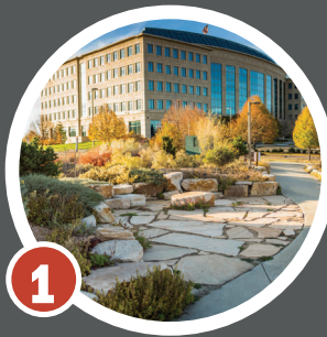
AURORA MUNICIPAL BUILDING