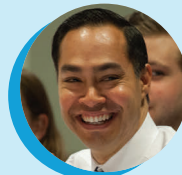
Julián Castro , Former Secretary of Housing and Urban Development; Former Mayor, San Antonio