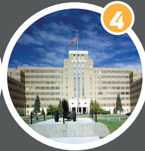
FITZSIMONS BUILDING 500