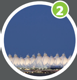
DENVER INTERNATIONAL AIRPORT