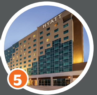
HYATT REGENCY HOTEL