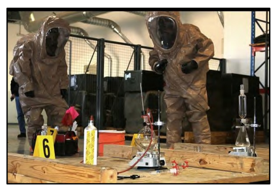
Colorado National Guard members demonstrate CBRN capabilities with their SPP partner in Jordan