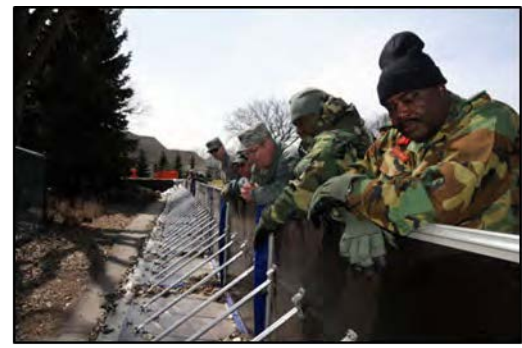
North Dakota NG and visiting Ghanaian dignitaries tour flood protection facilities, including an AquaFence in Fargo, ND