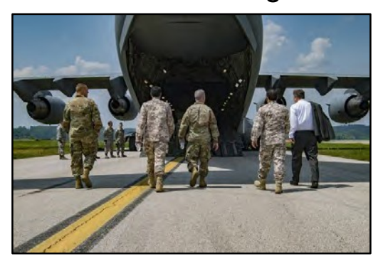
A delegation from Qatar visits West Virginia to commemorate the newest SPP partnership and learn more about WVNG capabilities