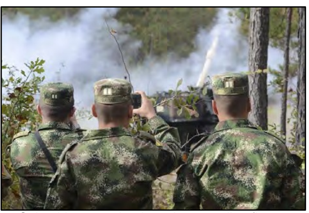
Colombian army leaders observe a live-fire exercise during an SPP exchange with the South Carolina National Guard