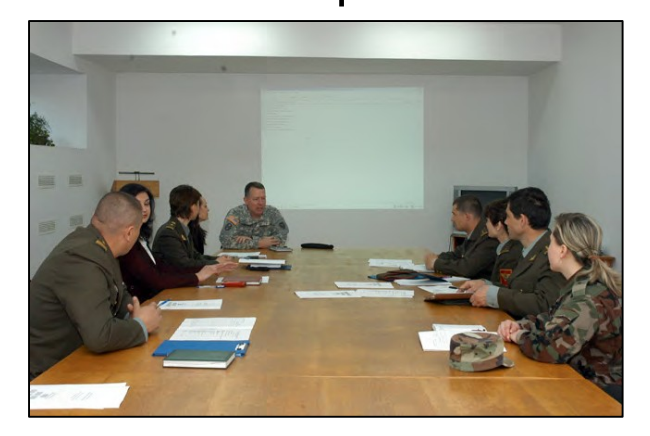
North Carolina NG Public Affairs officer and Moldovan Ministry of Defense officers discuss key points of effective public relations