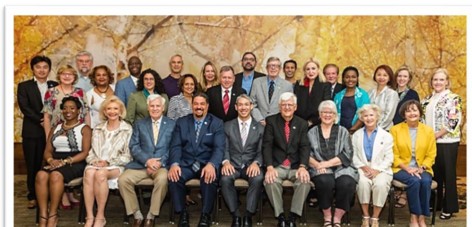
SCI 2019 Board of Directors